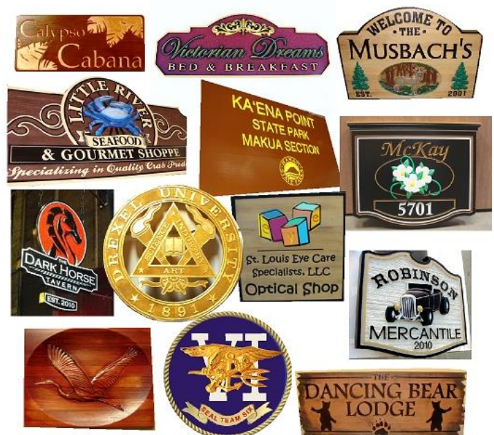
Fig 1 – Typical Signs & Plaques (see Catalog & Website)

Dimensional signs have a long and distinguished history, going back to ancient Greece and Rome, whose artisans made hand-hewn V-carved engraving and bas-relief sculptures on signs carved in stone. Chiseled engraved wood signs have been hung over sidewalks