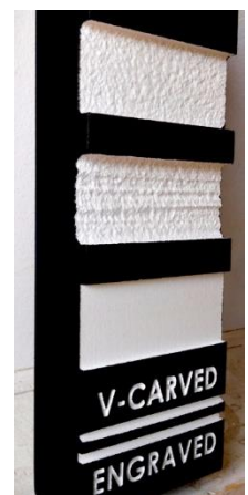
Fig 9 – HDU Sample

and (7) access to our 7000 photos of products on our website ( www.ArtSignWorks.com ) , and permission to use any of them when you are advertising our products. In addition to these free items, if you wish (it is not required), we will design and make an custom HDU or wood wall plaque with your company's name and logo or brand advertising " Carved Dimensional Signs & Plaques", for a deeply discounted price, 50% of wholesale. Your price for this attractive wall plaque is only $100 for a 24 inch x 18 inch carved and sandblasted wall plaque, painted in colors of your choice. Our retail price of this plaque would be $260. Shipping is additional (depends on size).