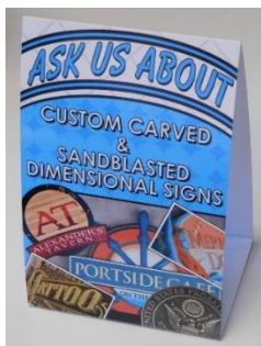
Fig 10- Desktop display