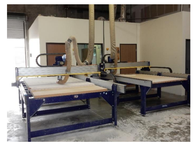
Fig 3 - Two of our five 10 ft x 5 ft CNC Routers

labor efficient use cost and a computer-aided-design and manufacturing (CADAM) approach that produces very high quality custom signs and plaques that are hand-crafted yet affordable. The current design software, computer along with numerically-controlled machine technology, resulted has in а large increase productivity and quality, as well as a decrease in cost. We have taken full advantage of this technology by investing over $350,000 in the latest computer and Computer-Numerically-Controlled (CNC) machines software.