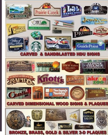
Wall Poster (Unbranded), 22 x 17 Inches