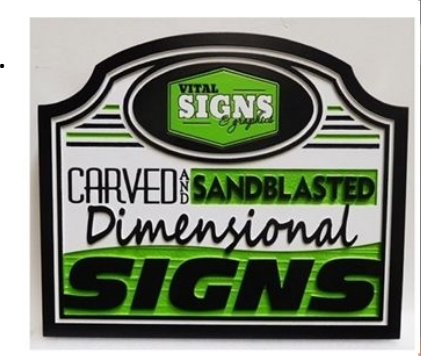
Fig 9 - HDU Sample

to our 15,000 photos of products on our two websites www.artsignworks.com and www.woodmetalplaques.com, and permission to use any of them when you are advertising our products. In addition to these free items, if you wish (it is not required), we will design and make an custom HDU or wood wall plaque with your company's name and logo or brand advertising "Carved Dimensional Signs & Plaques", for a deeply discounted price. Your price for this attractive wall plaque is only $90 for a 24 inch x 18 inch custom carved and sandblasted wall plaque, painted in colors of your choice. (example i Fig 9) Our retail price of this plaque would be $250. Shipping is free. For repeat customers, we provide this sample for