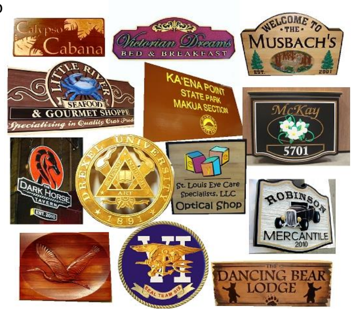
Fig 1 – Typical Signs & Plagues (see Catalog & Website)

Dimensional signs have a long and distinguished history, going back to ancient Greece and Rome, whose artisans made hand-hewn V-carved engraving and bas-relief sculptures on signs carved in stone. Chiseled engraved wood signs have been hung over sidewalks