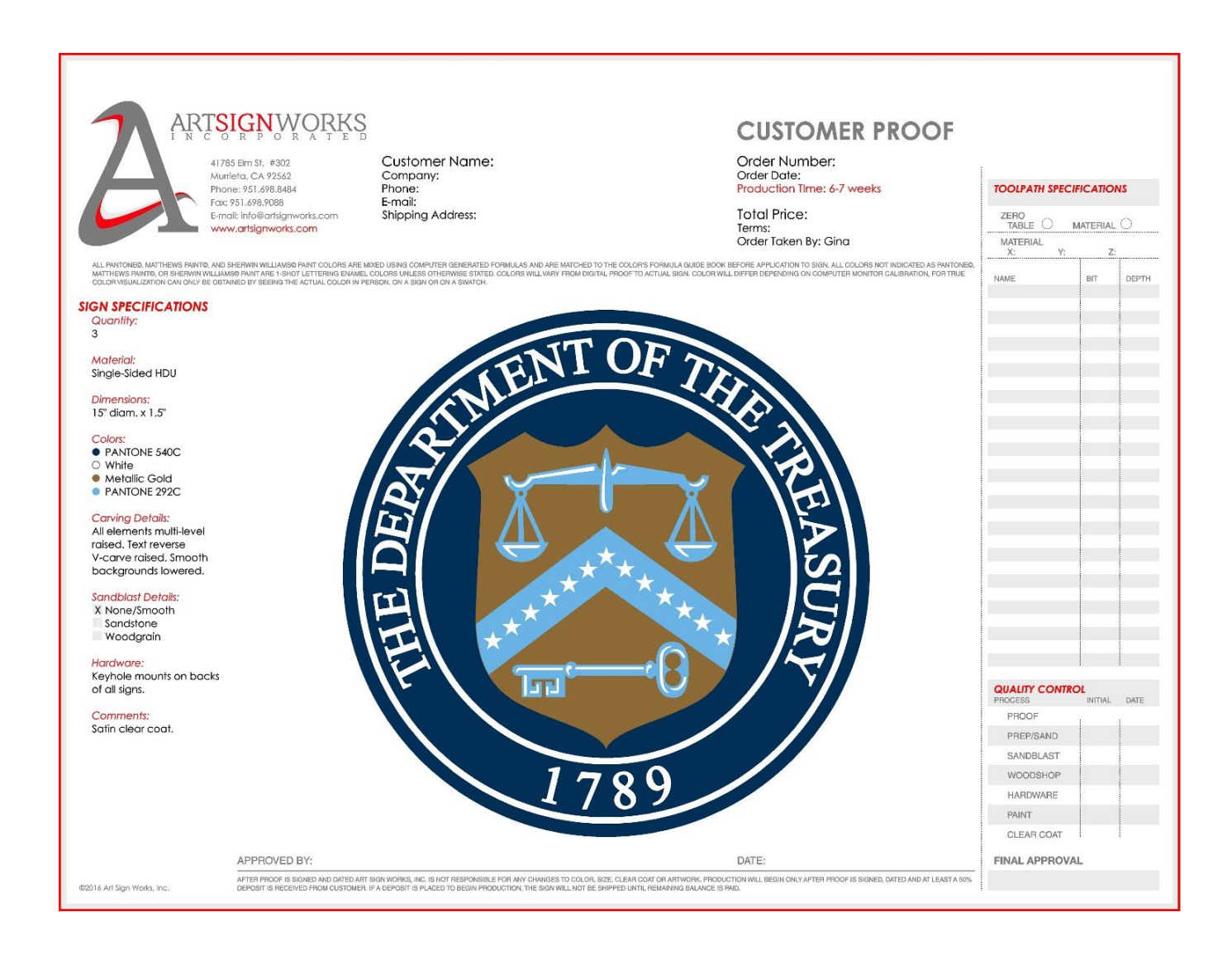
Fig 7 – Example of a Production Proof for a Wall Plaque Toolpath. Specification on right will be filled out during initial production phase; Quality Control will fill-in sign-offs during Production.